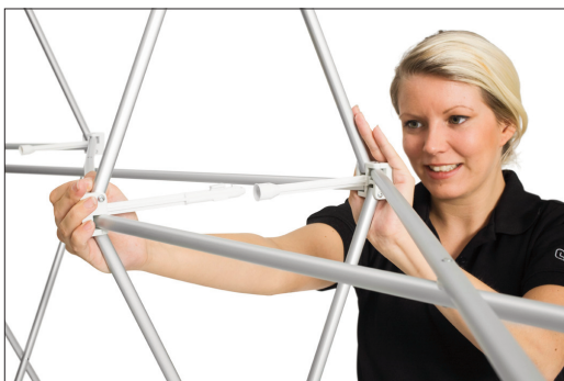
Easily attach the locking connectors on the Expand MediaWall