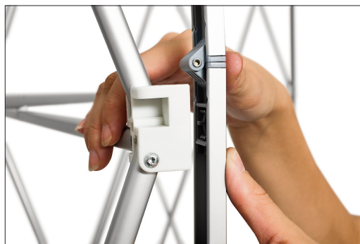
Simply install the durable magnetic bars to the frame.