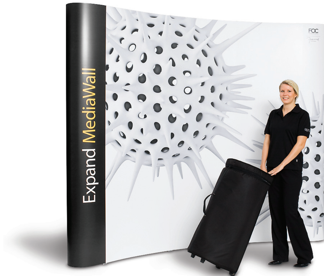
The Expand MediaWall is easy to transport in the padded, nylon bag with wheels.